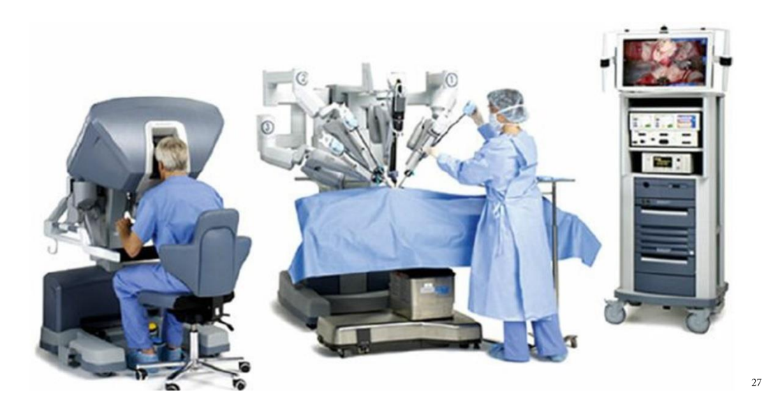
Figure 1. Robotic Assisted Surgery